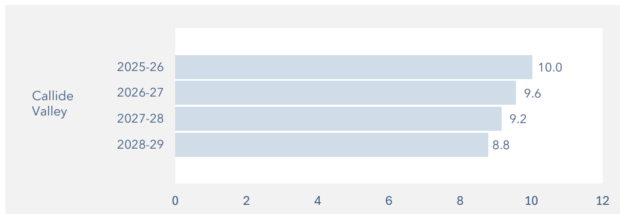
Figure 1: Annual changes in irrigation prices, from 2025-26 to 2028-29 (% change)

Note: The analysis is based on the total price per megalitre of the water access entitlement (WAE) for this tariff group, which is derived as the total fixed price plus the total volumetric price multiplied by the assumed scheme usage as a percentage of the WAE (64.4% of WAE for this tariff group).