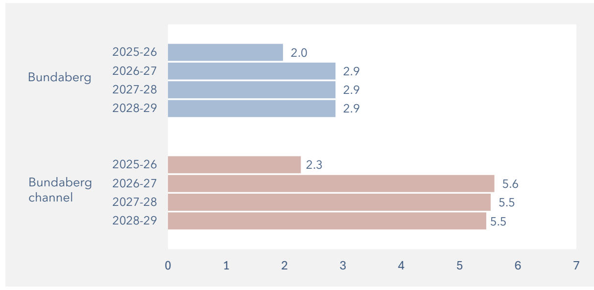
Figure 1: Annual changes in irrigation prices, from 2025-26 to 2028-29 (% change)

Based on our price recommendations, we estimated the average change in irrigation prices for each year of the price path period from 2025-26 to 2028-29 (Figure 1). Price changes for individual customers would vary if their water usage differs from the assumed scheme usage.